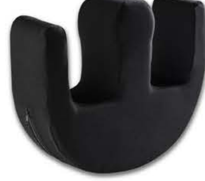
ORZEN HASTA ÇEVİRME APARATI Orzen Patient Turning Apparatus