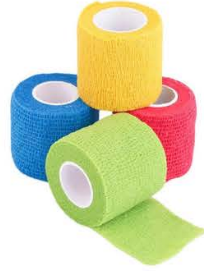
ORZEN COBAN BANDAJ 7,5CM X 4,5M Orzen Coban Bandage 7,5cm x 4,5m