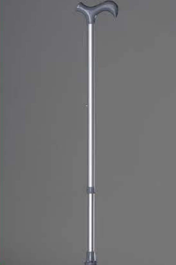
ORZEN AYARLI ASA Orzen Adjustable Walking Stick (Lux)