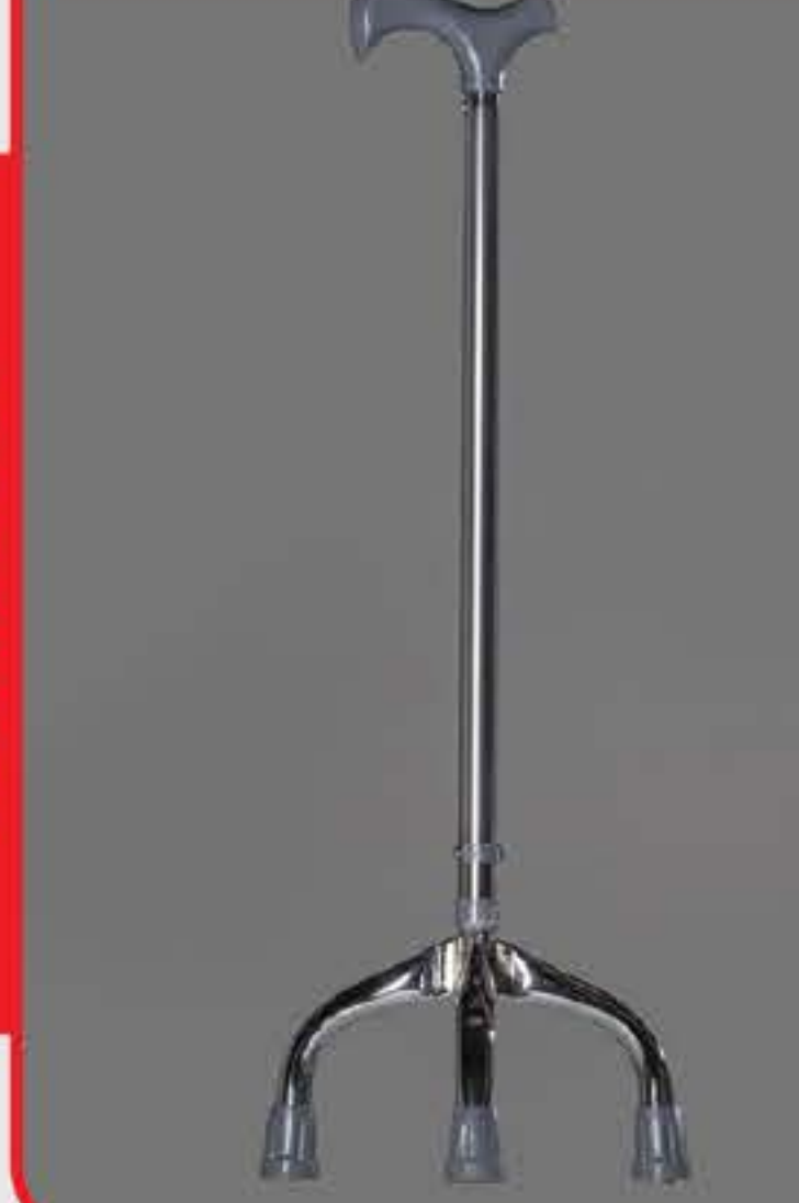
ORZEN KROM DENGE BASTONU 3'LÜ Orzen Tripod Balance Cane Chromium