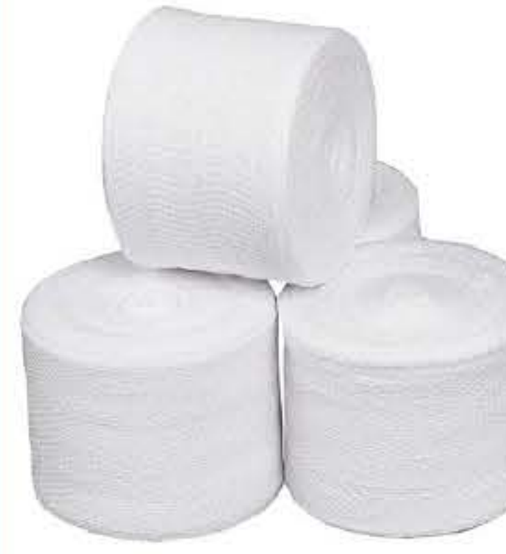
ORZEN SARGI BEZİ Orzen Bandage