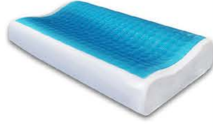
ORZEN VİSKO YASTIK JELLİ Orzen Visco Pillow With Gel