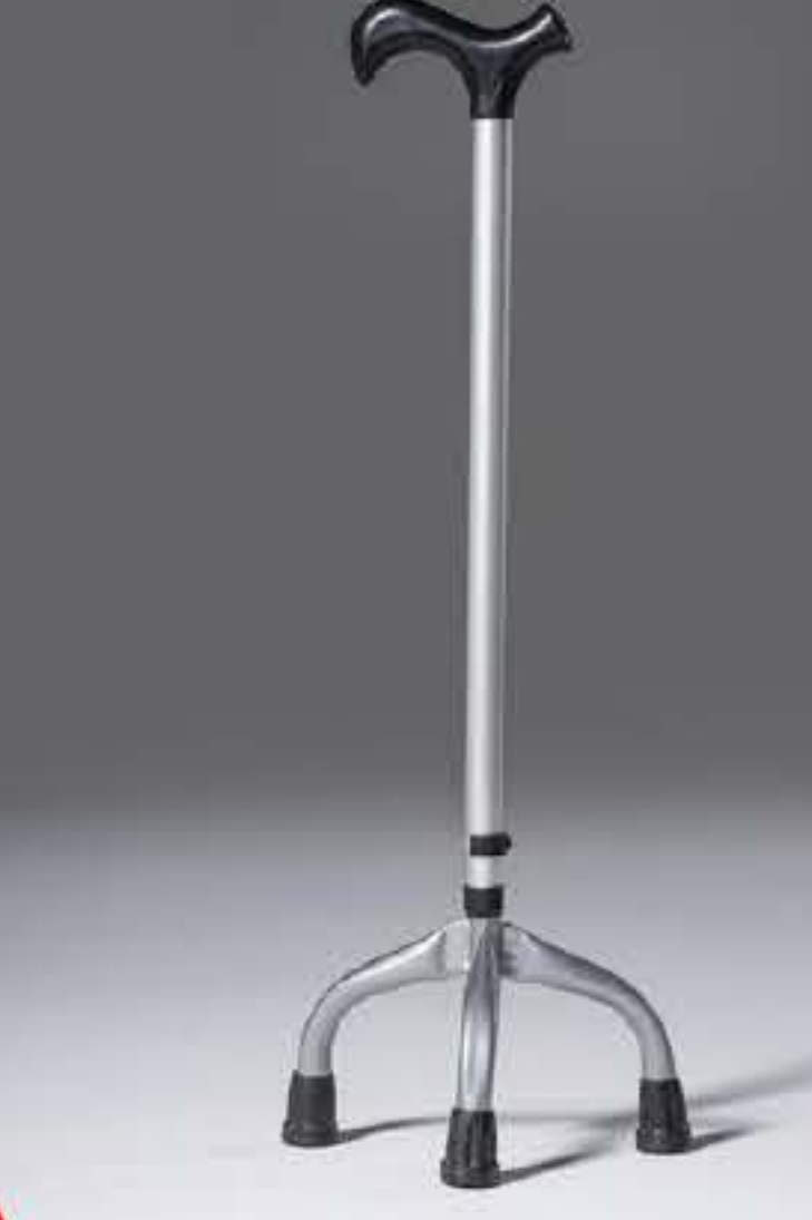
ORZEN TRİPOD DENGE BASTONU Orzen Tripod Balance Cane