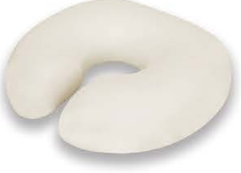
ORZEN OTURMA SİMİDİ UCU AÇIK Orzen Seat Ring Open Front