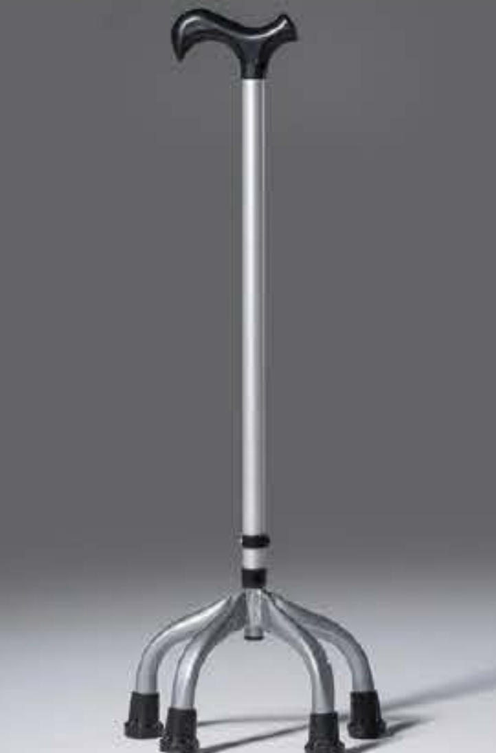
ORZEN QUADRAPOD DENGE BASTONU Orzen Quadrapod Balance Cane