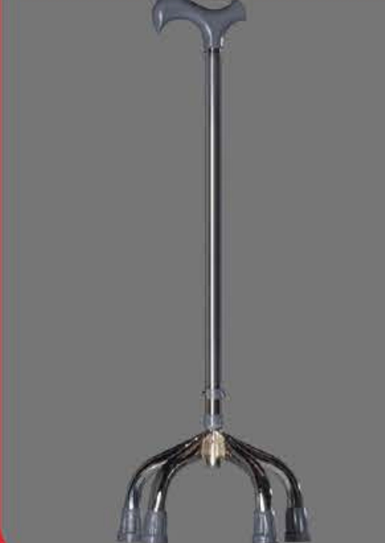
ORZEN KROM DENGE BASTONU 4'LÜ Orzen Quadrapod Balance Cane Chromium