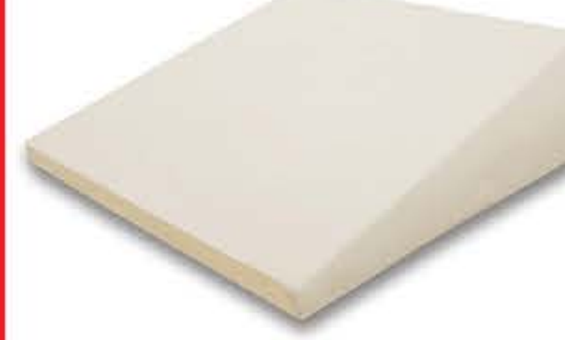
ORZEN REFLÜ YASTIĞI Orzen Reflux Pillow