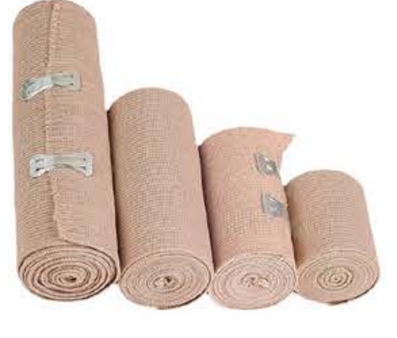
ORZEN BANDAJ ELASTİK Orzen Elastic Bandage