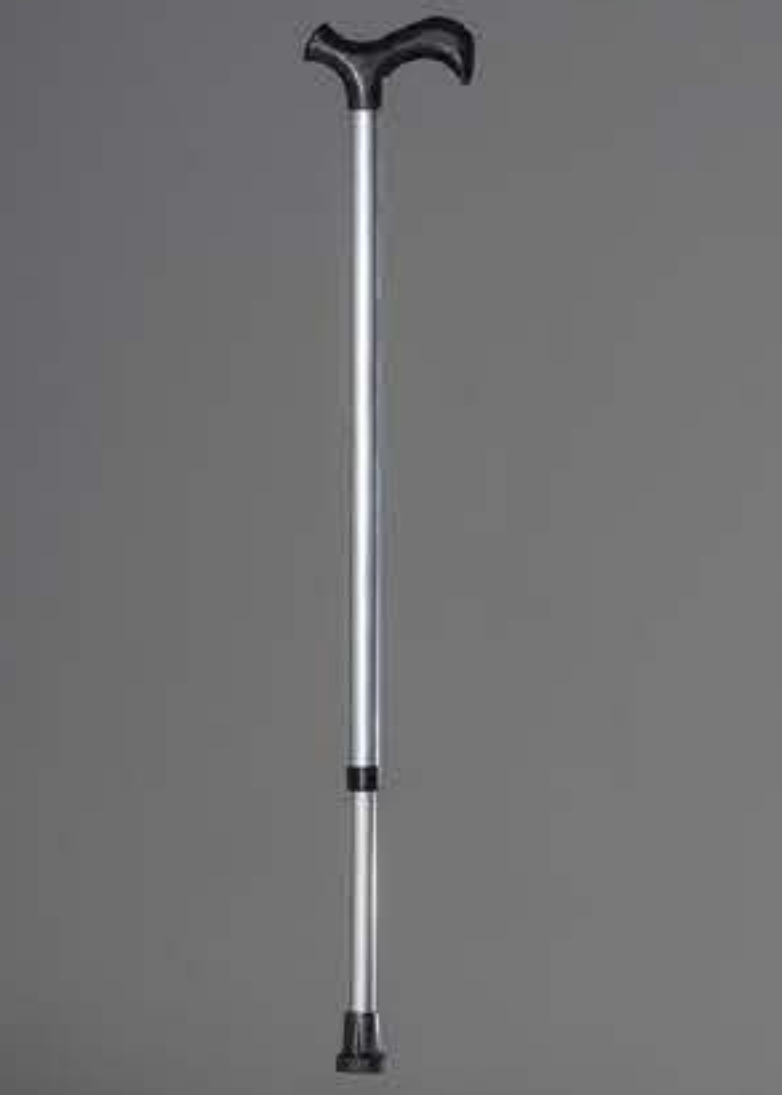
ORZEN AYARLI ASA Orzen Adjustable Walking Stick