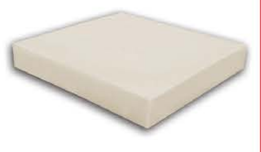
ORZEN OTURMA MİNDERİ Orzen Seat Cushion