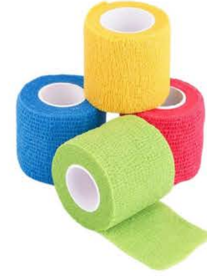
ORZEN COBAN BANDAJ 10CM X 4,5M Orzen Coban Bandage 10cm x 4,5m