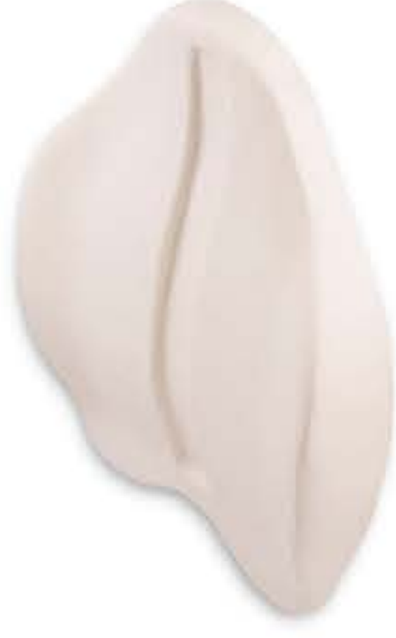
ORZEN BEL MİNDERİ SUPPORT Orzen Waist Cushion Support