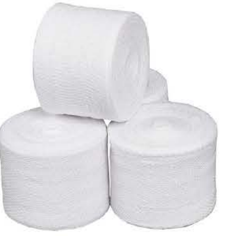
ORZEN SARGI BEZİ Orzen Bandage